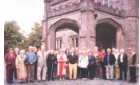
Historical Society group outside Blairquhan