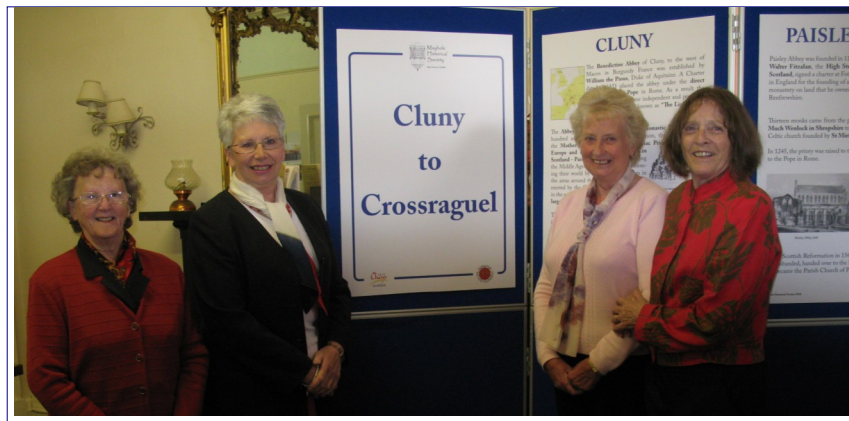
The team who put the Cluny Exhibition together

THE GLASGOW NECROPOLIS —this is a most fascinating place to visit. The Friends of the Glasgow Necropolis do tours and their next tour (booking essential) is during the Open Doors for Glasgow on Saturday 18th and Sunday 19th September—visit their website:- www.glasgow-necropolis.org