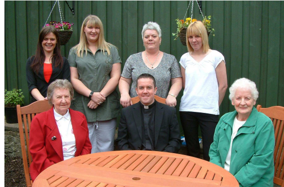
Committee Members and Staff at the first anniversary celebration of Maybole One Stop Shop

Since we opened the service has developed links with a number of agencies and outreach services. We want to make sure that as many people as possible are aware of what we have on offer and can refer clients.