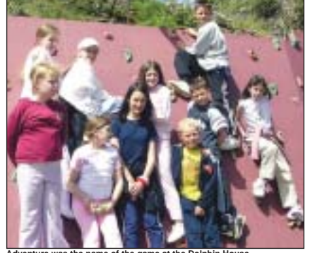
Adventure was the name of the game at the Dolphin House.