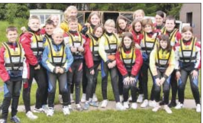
READY to make a splash with sailing and kavaking at the Dolphin House

To add any new details for organisations in Maybol please contact Maybole Resource Centre.