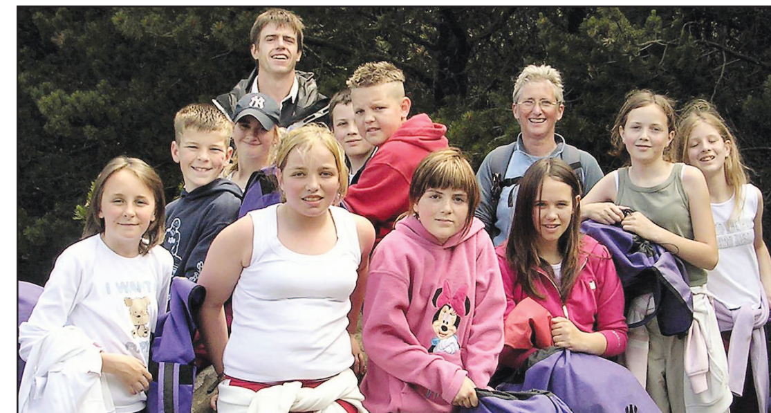
Everyone agreed that the visit to the Dolphin House was a great treat.