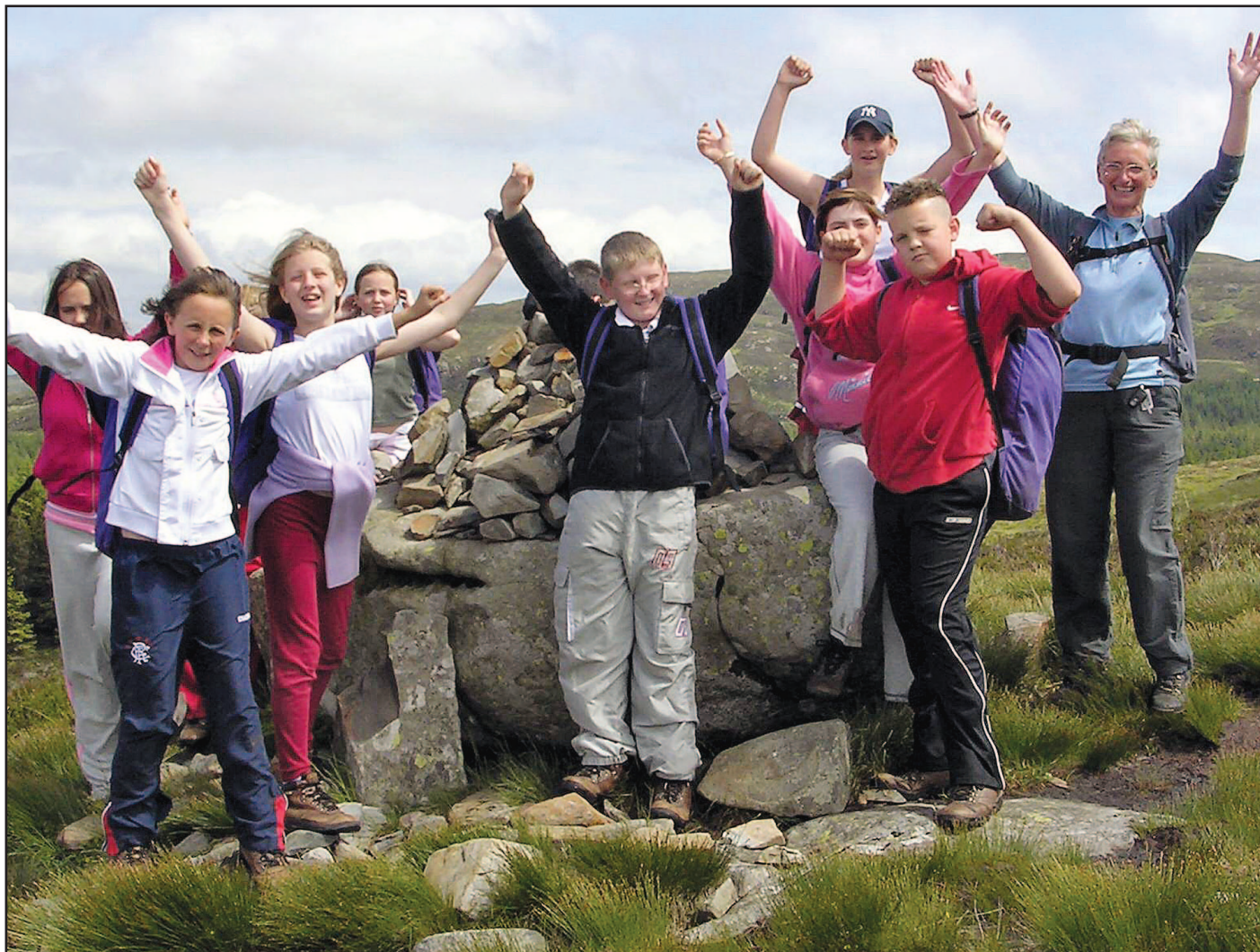
IT felt champion to make it to the top of the hill.