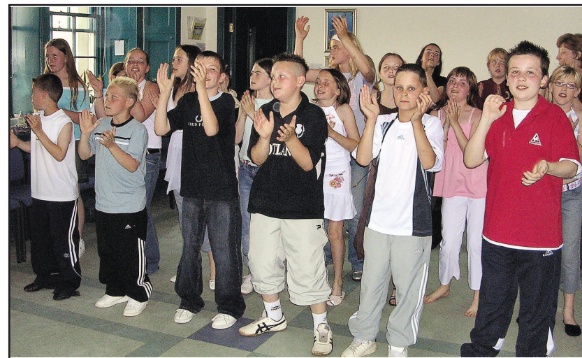
You've got to hand it to those Cairn Primary Kids, they know how to enjoy themselves.