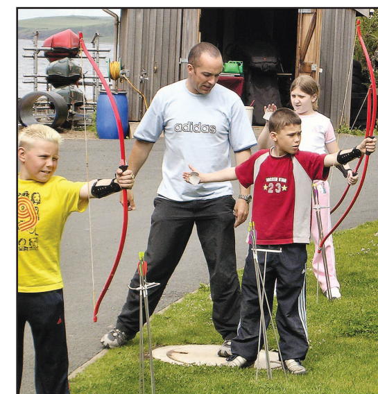
Cairn kids take aim, and hope to hit the Bullseye!