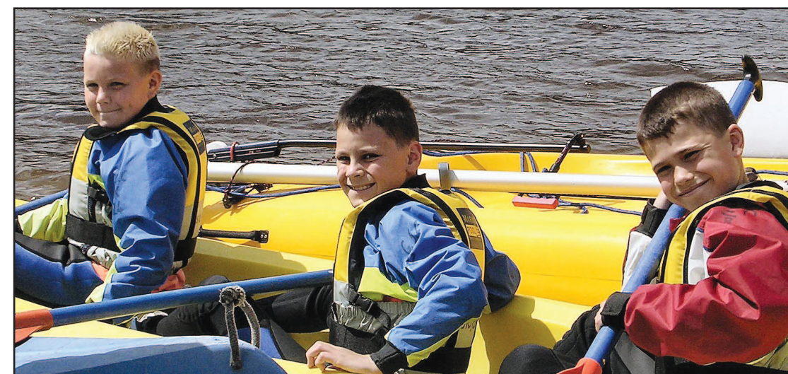
Smiles all round as these lads look forward to some fun on the water.