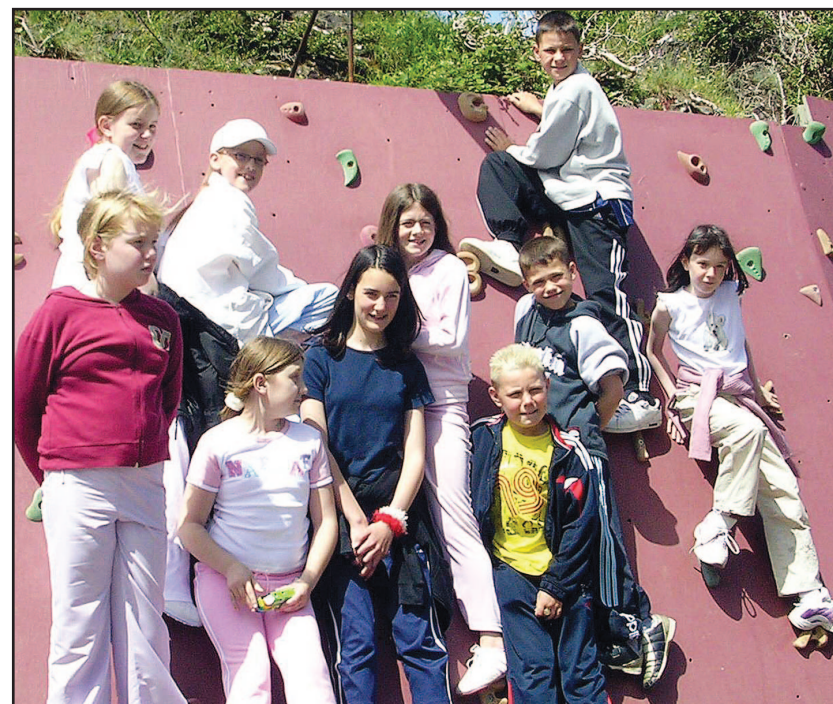
Adventure was the name of the game at the Dolphin House.