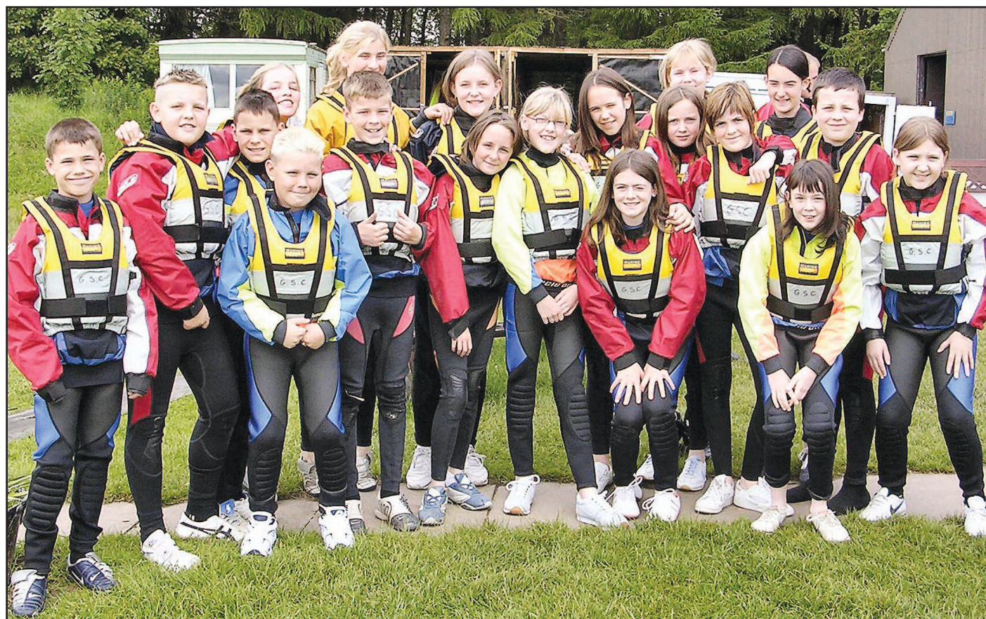
READY to make a splash with sailing and kayaking at the Dolphin House.