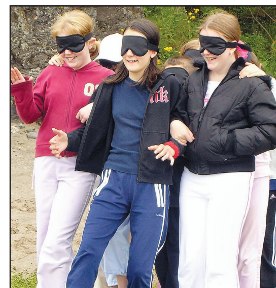
These kids had a blinding time during their three day stay.

A great time was had by all – and the current P7 can hardly wait 'til it's their turn!