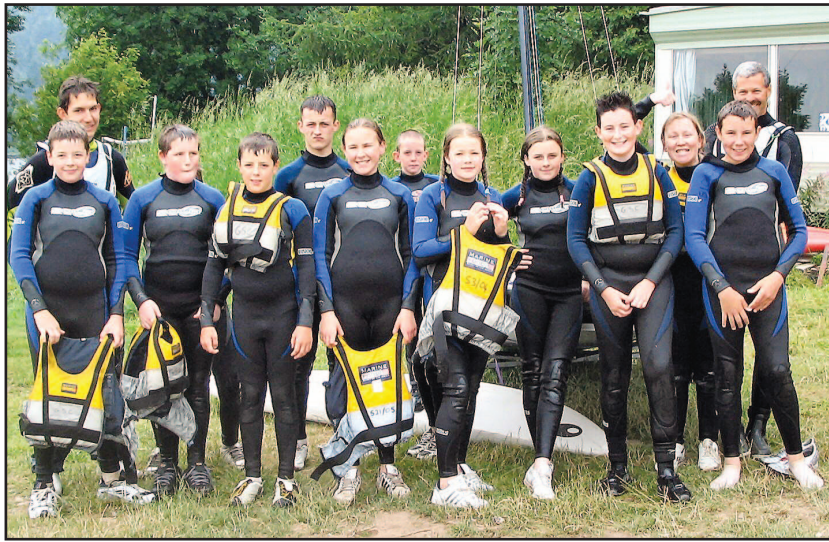
The wet suits were on and the members of Maybole Youth Club were ready to make a splash this summer.

The club would like to thank all staff involved for making it a great summer and also the local action fund for grant money made available through the Scottish Executive which made the whole thing possible.