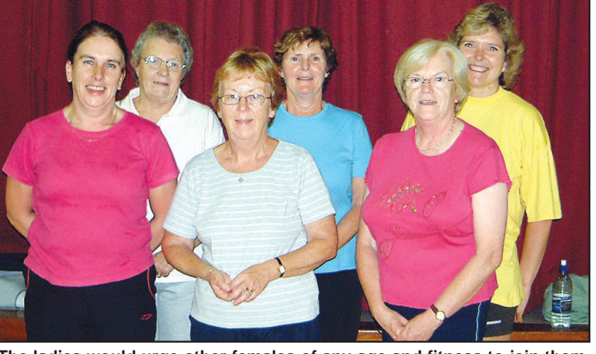
The ladies would urge other females of any age and fitness to join them on a Monday night.