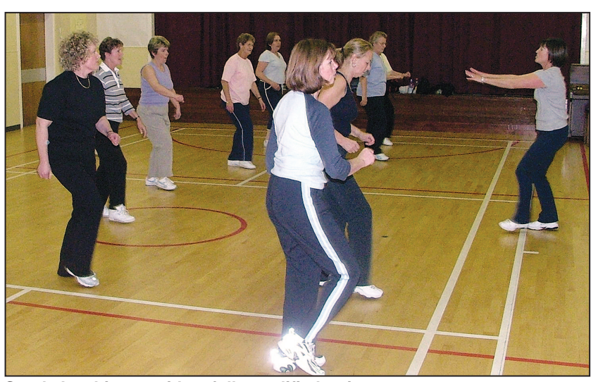
South Ayrshire provide a fully qualified trainer.