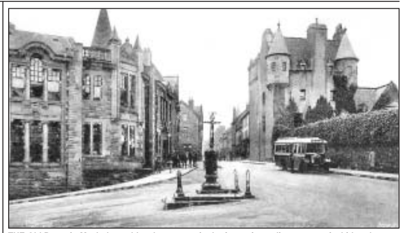
THE Old Pump in Maybole could make a return in the form of a replica as part of a bid to the Heritage Lottery Fund being planned by the Community Council, Community Association and the Historical Society.

why not come along and join the Maybole Men's Health Forum either at a 'Games Night' or any Thursday at 7.30pm at Carrick Academy gym.