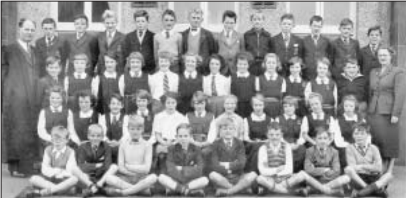
CARRICK Academy Primary pupils in 1956 - can you spot the Magnificent Seven?

ings four times a year and their trip away each year. They also have plans for a future foreign trip to help celebrate their 65th birthday and hope to retain their enthusiasm for travel for many years to come.