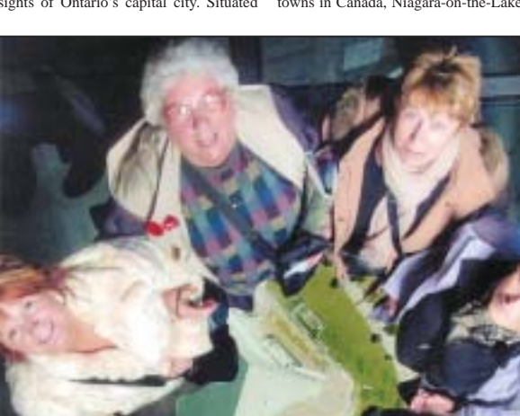
CLEARLY not afraid of heights at the dizzying glass floored CN Tower some 1,815 feet above the city.