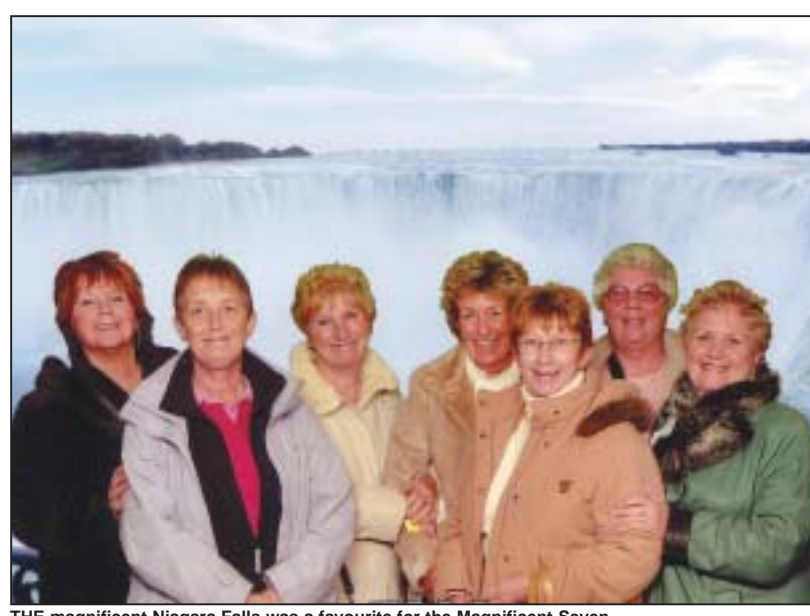
THE magnificent Niagara Falls was a favourite for the Magnificent Seven.