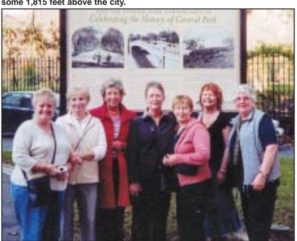
THE seven girls were among the 25 million annual visitors to New York's Central Park.