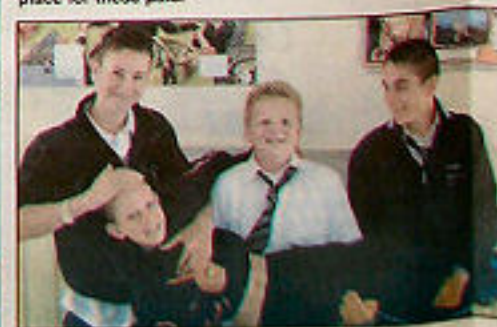
WITH a little help from my friends.