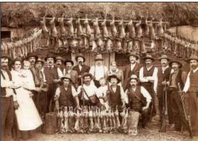
WOODSTOCK Gun Club rabbit shoot in 1904.