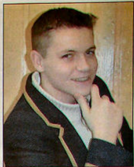
PUPILS think the 2006 Carrick Academy Yearbook will be one of the best yet.