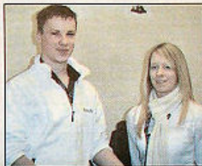
TAKING a break from the busy schedule to complete this year's Carrick Academy Yearbook.