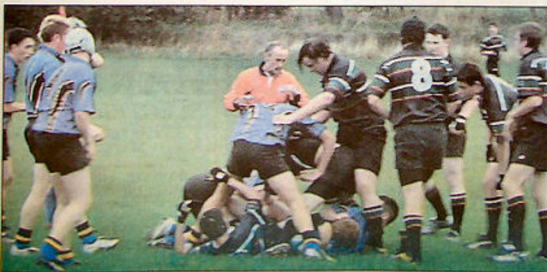
ANOTHER season of successes on the rugby field for Carrick Academy.