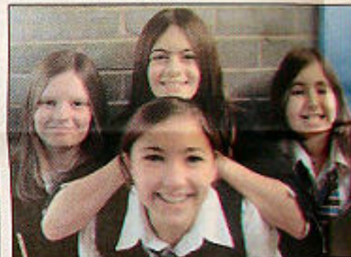
THESE pupils are happy to be at Carrick Academy.