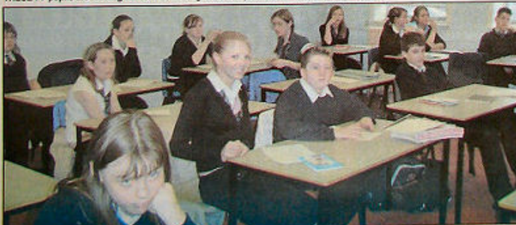
CARRICK Academy pupils are a class act.