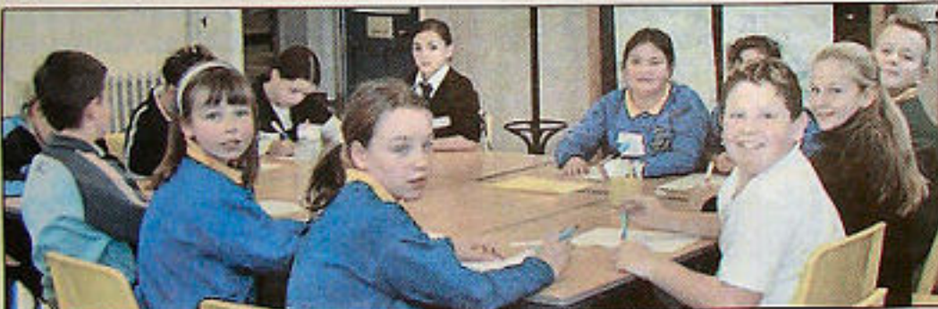
THESE P7 pupils are looking forward to starting their first year at Carrick Academy in August.