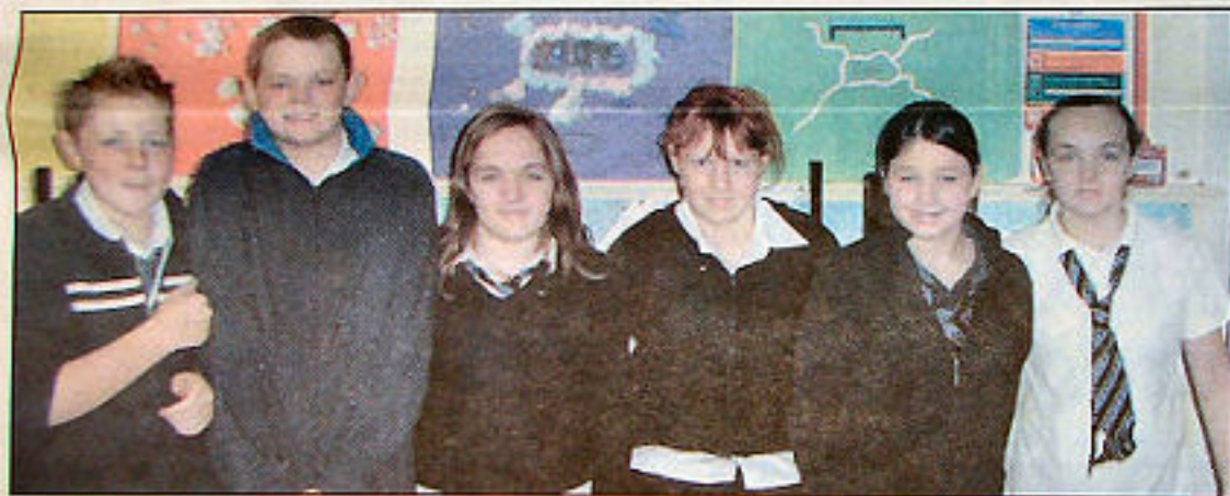
THIS group of smiling youngsters are happy to be pupils at Carrick Academy.