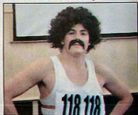
RAISING a 'quick' buck for Children in Need at Carrick Academy.