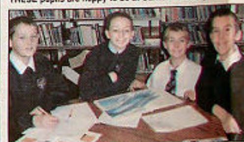
THE school library at Carrick Academy is a popular meeting place for these pals.