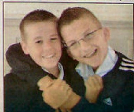
OLD pals act at Carrick Academy.