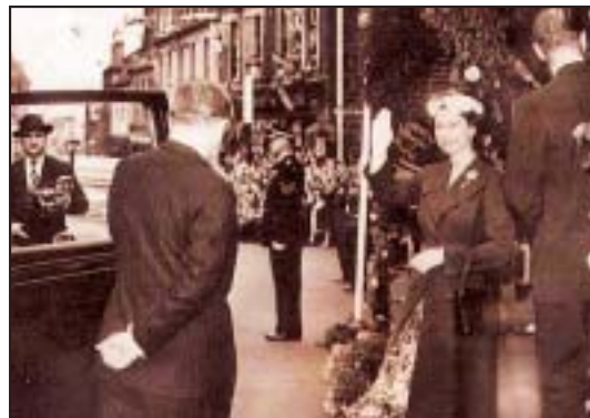
THE Queen waves to Maybole residents as she leaves the Town Hall.