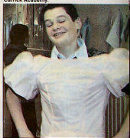
THE Frocky Horror show at Carrick Academy.