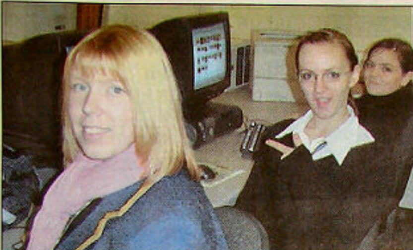
MEMBERS of the Carrick Academy Yearbook Team hard at work.

This year the Yearbook will be produced and printed wholly in the school and available to buy in June for only £5 each. Please contact the school if you wish to order a copy.