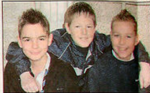
THREE Carrick Academy amigos.