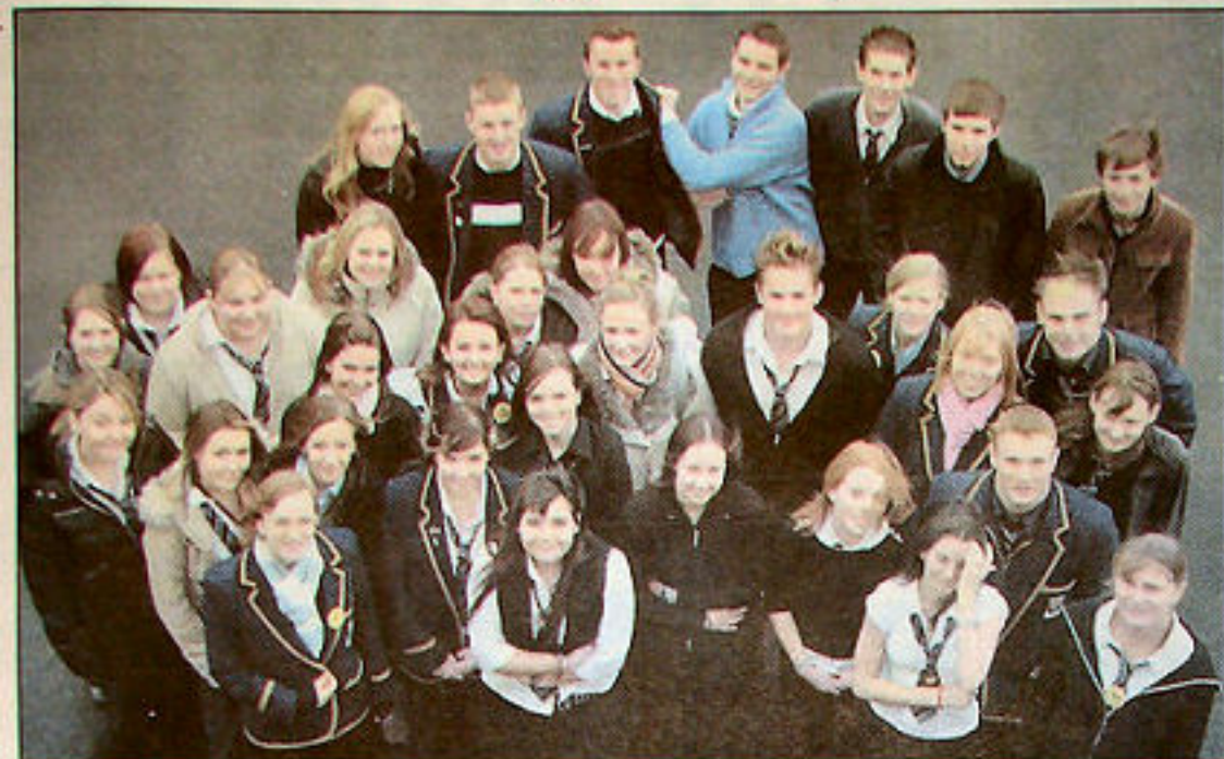
THE Carrick Academy Peer Help Group.