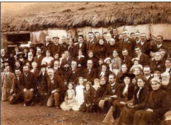
DIAMOND Wedding celebrations in 1914.