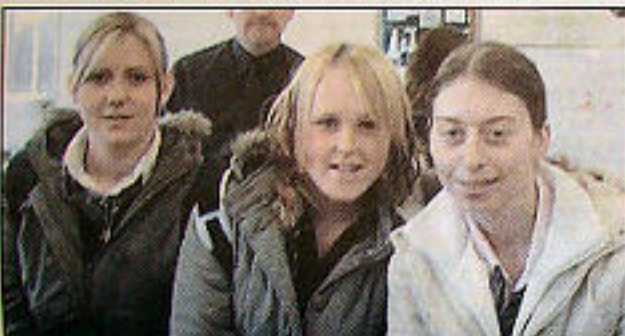
SENIOR pupils at Carrick are hoping that the 2006 school Yearbook is popular with everyone in the community.