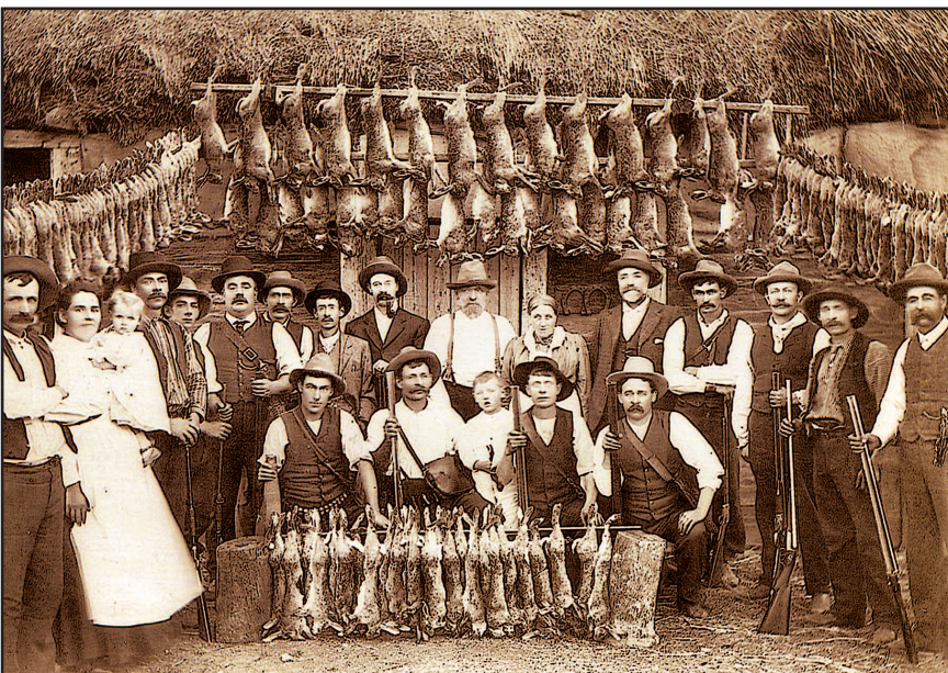
WOODSTOCK Gun Club rabbit shoot in 1904.

Local people are also able to find out what's happening in the area.