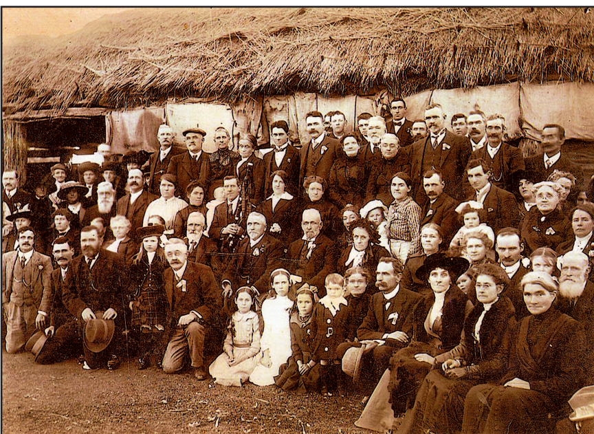
DIAMOND Wedding celebrations in 1914.