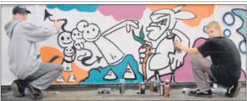
FIND out what these lads are up to on page 8.

Studio: 01655 883137 - Mobile: 07811 657763 Email: contact@hdvc.co.uk