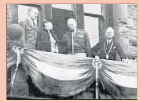
Ike's Scottish White House Page 4