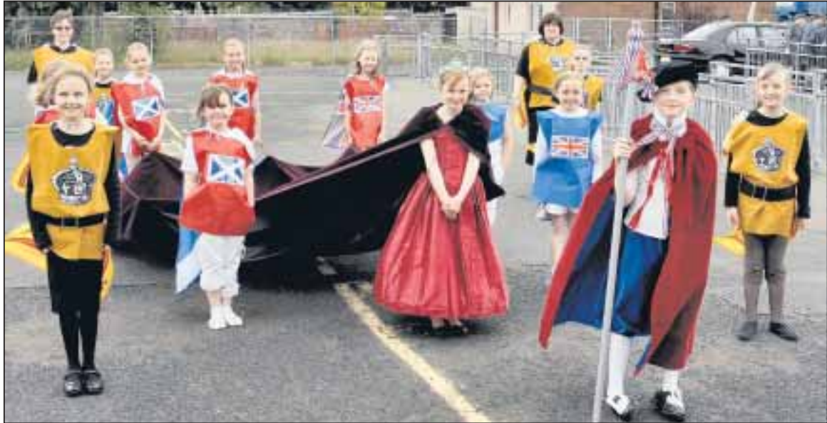
MAYBOLE Brownies took first prize in the Best Walking Group at the towns Gala Day.