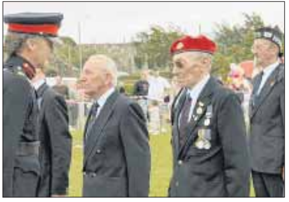
MAYBOLE Branch of the Royal British Legion under inspection at the town Gala Day during Trooping the Culzean. Colour.

Two months after the formation of the Maybole Branch, the title became The British Legion (Scotland) when Earl