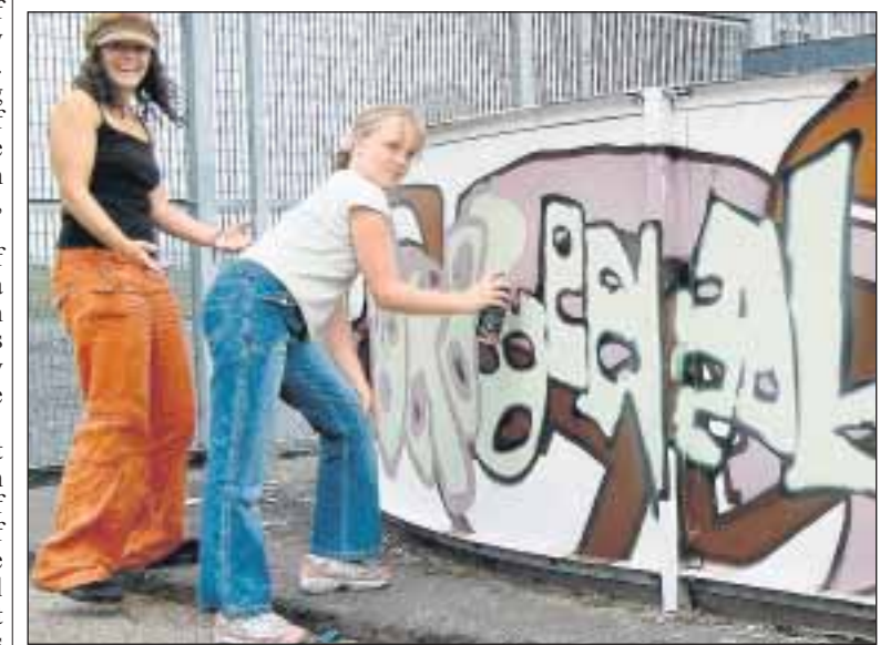
What's Going On Here?

To find out more information for the above, please contact the fundraising committee. Please also remember there are the Maybole Parish Church Choin CD and other merchandise available from the Church and the Resource Centre. There will also be local Maybole Christmas cards for sale this year. If you would like to order a pack or find out more information, again please contact the fundraising committee who will be able to give you prices for the items