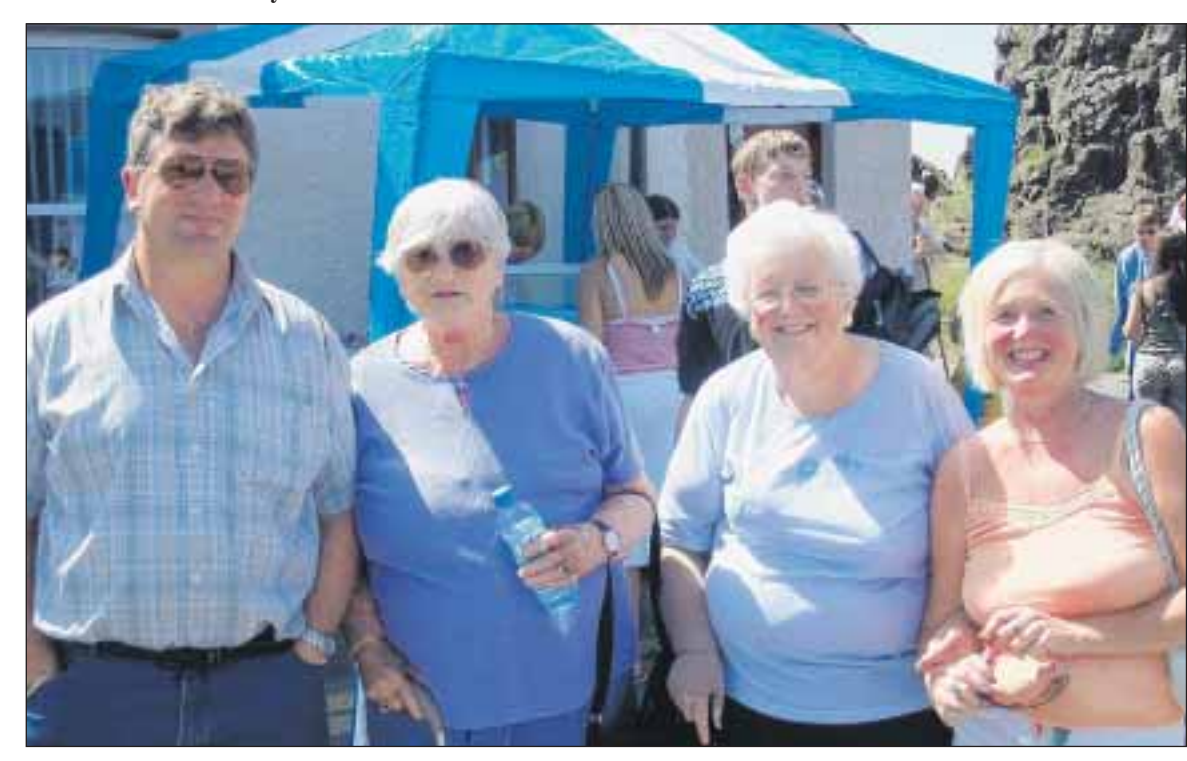
RESIDENTS of Dunure soaked up the atmosphere, and the sun, at the village Harbour Gala last month.