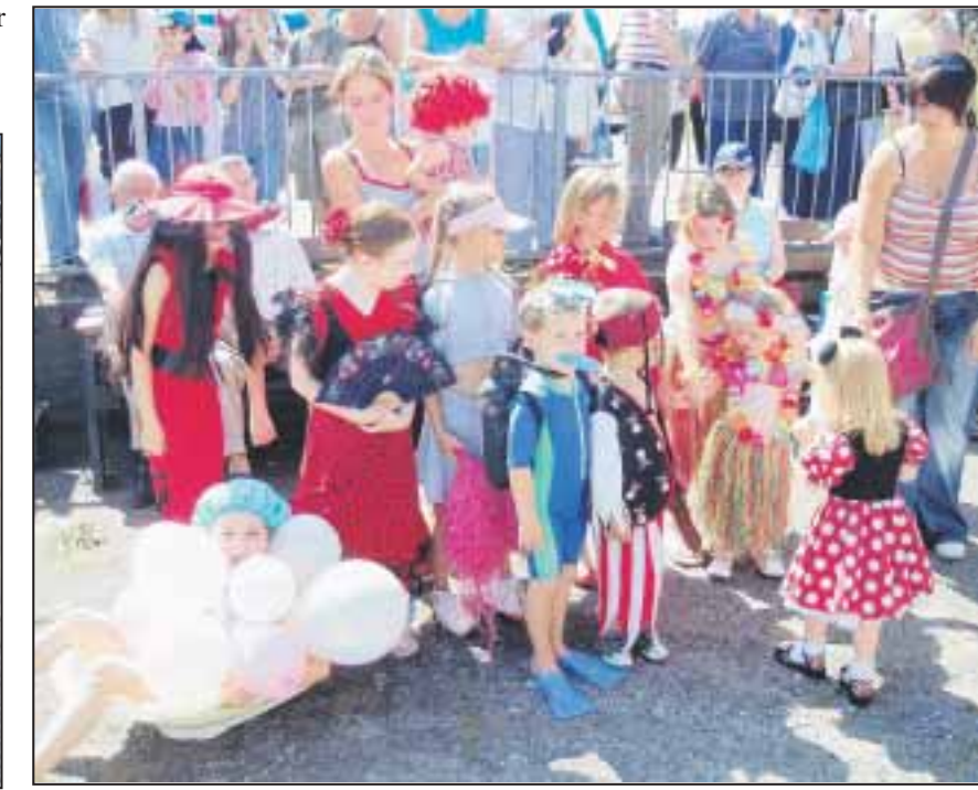
DUNURE youngsters dressed up for the fabulous and fun occasion of the Harbour Gala recently.